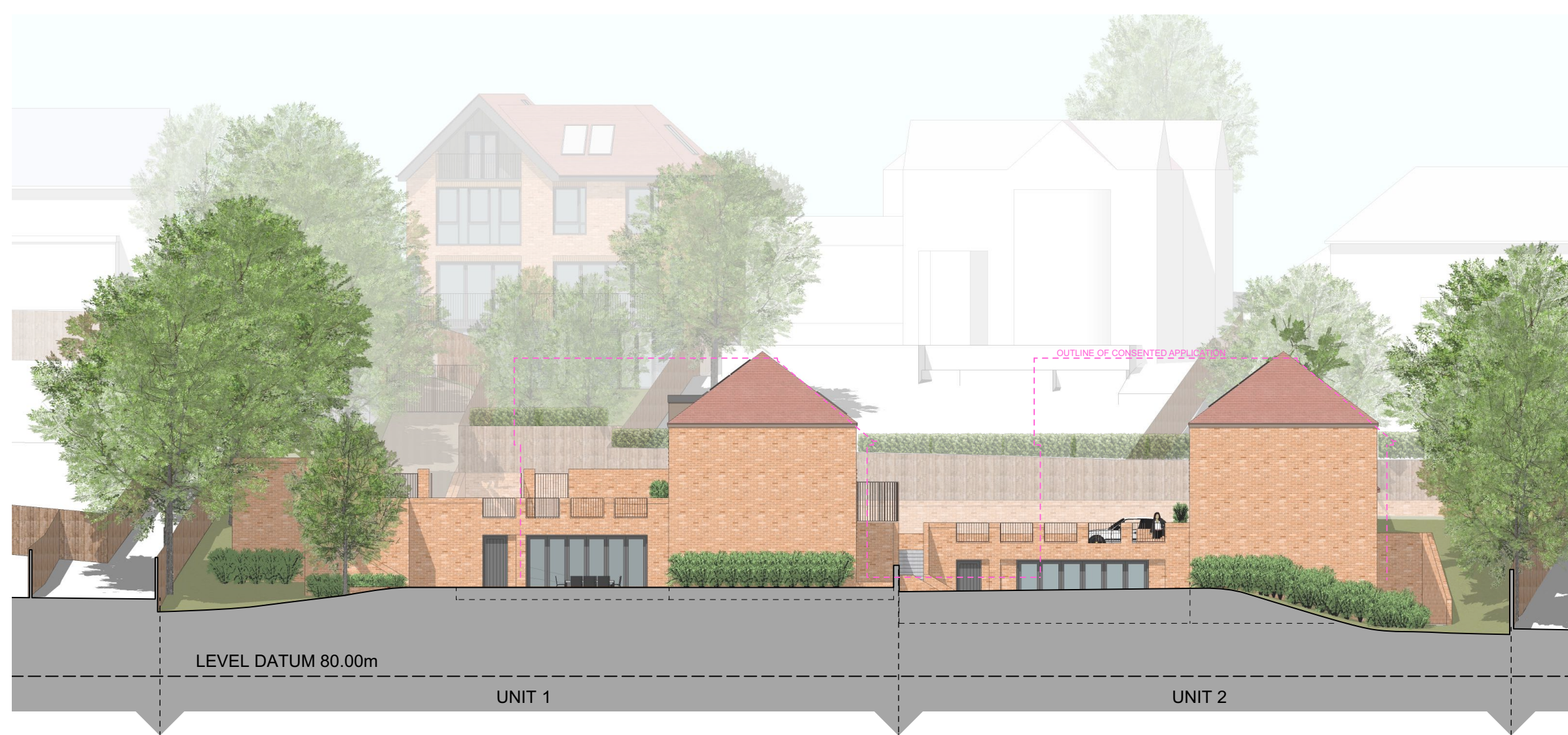
UNIT 1 & 2 - EAST ELEVATION (a)