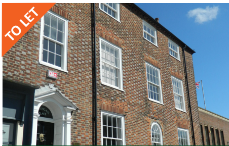
41-42 Southgate, Chichester