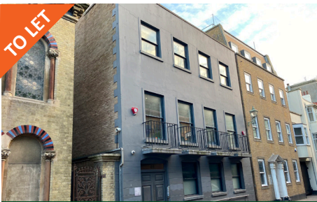
68 Middle Street, Brighton