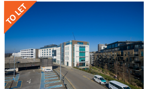
City View, New England Quarter, 103 Stroudley Road, Brighton