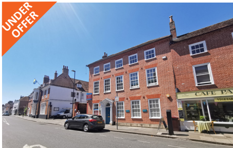
44 North Street, Chichester