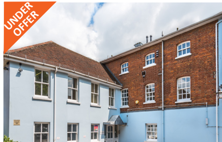
Suites 2 & 3, The Victoria, 25 St. Pancras, Chichester