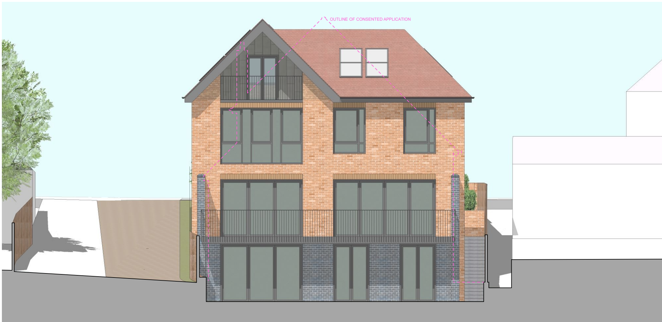
No. 6 - EAST ELEVATION

This drawing is for the below approval only and is subject to Planning Approval. This drawing has been based on third party survey and scheme drawings. Do not scale from this drawing (LA Planning Dept. can scale the drawings). The Architect, Turner Associates & Richard Silver (RS Design - Architect Ltd.), own the copyright in the drawings and documentation produced in the course of the project. The client named below has a licence to copy and use the drawings and documentation only for purposes related to the project named below at the stage noted above. No drawings or client details will be released to anyone other than the client, unless given written instruction for distribution.