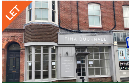
85 High Street, Hurstpierpoint