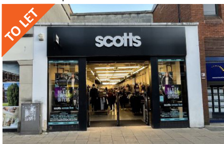
222-224 Commercial Road, Portsmouth