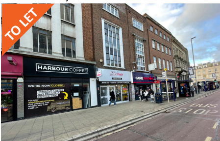
99 Commercial Road, Portsmouth