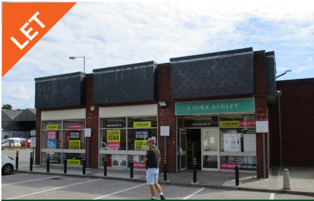
3 Eastgate Centre, Lewes