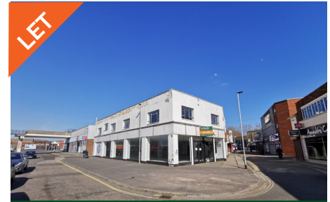
12-18 Charlotte Street, Portsmouth