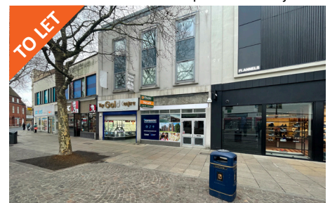
248C Commercial Road, Portsmouth