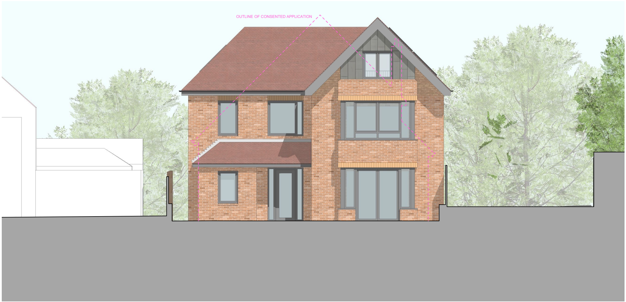
No. 6 - WEST ELEVATION

This drawing is for the below approval only and is subject to Planning Approval. This drawing has been based on third party survey and scheme drawings. Do not scale from this drawing (LA Planning Dept. can scale the drawings). The Architect, Turner Associates & Richard Silver (RS Design - Architect Ltd.), own the copyright in the drawings and documentation produced in the course of the project. The client named below has a licence to copy and use the drawings and documentation only for purposes related to the project named below at the stage noted above. No drawings or client details will be released to anyone other than the client, unless given written instruction for distribution.