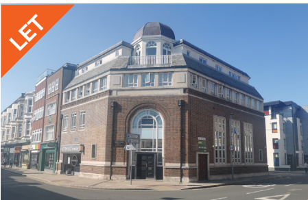
LET 71 Osborne Road, Southsea