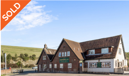
SOLD Newmarket Inn, Old Brighton Road, Lewes,