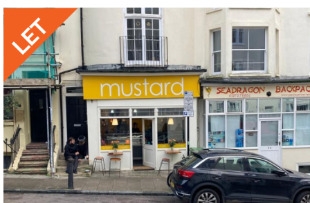
LET 35 Waterloo Street, Hove