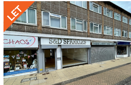
LET 37 Market Parade, Havant