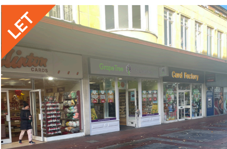
LET 16 Palmerston Road, Southsea