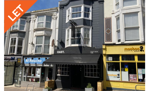
LET 45 Preston Street, Brighton