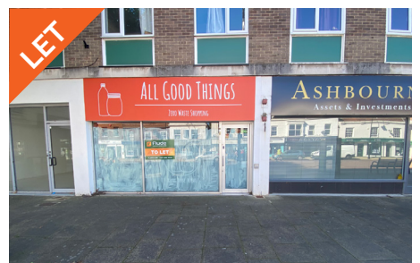
LET 2 West Quay House, Fareham