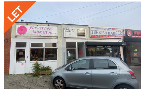
LET 1A Fareham Park Road, Fareham