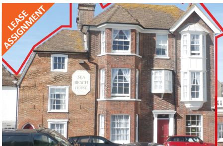
LEASE ASSIGNMENT Sea Beach House Hotel, 39-40 Marine Parade, Eastbourne