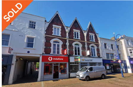
SOLD 94 High Street, Gosport