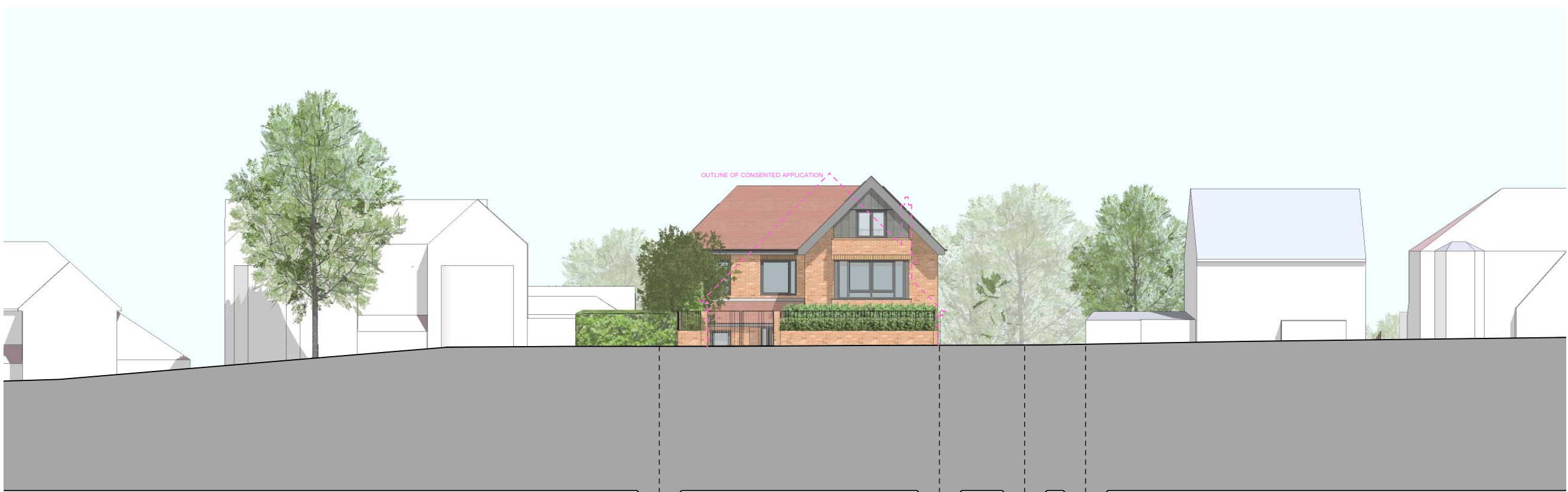
STREET ELEVATION - REPLACEMENT HOUSE (WEST ELEVATION)

This drawing is for the below approval only and is subject to Planning Approval. This drawing has been based on third party survey and scheme drawings. Do not scale from this drawing (LA Planning Dept. can scale the drawings). The Architect, Turner Associates & Richard Silver (RS Design - Architect Ltd.), own the copyright in the drawings and documentation produced in the course of the project. The client named below has a licence to copy and use the drawings and documentation only for purposes related to the project named below at the stage noted above. No drawings or client details will be released to anyone other than the client, unless given written instruction for distribution.