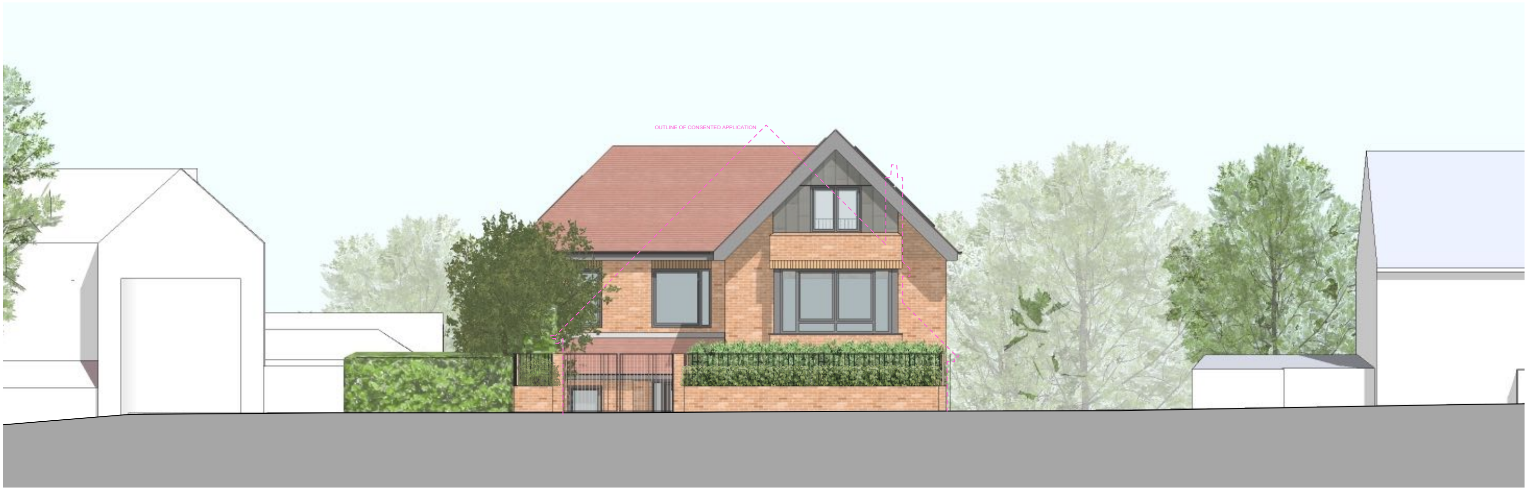
scale 1:100 @ A3