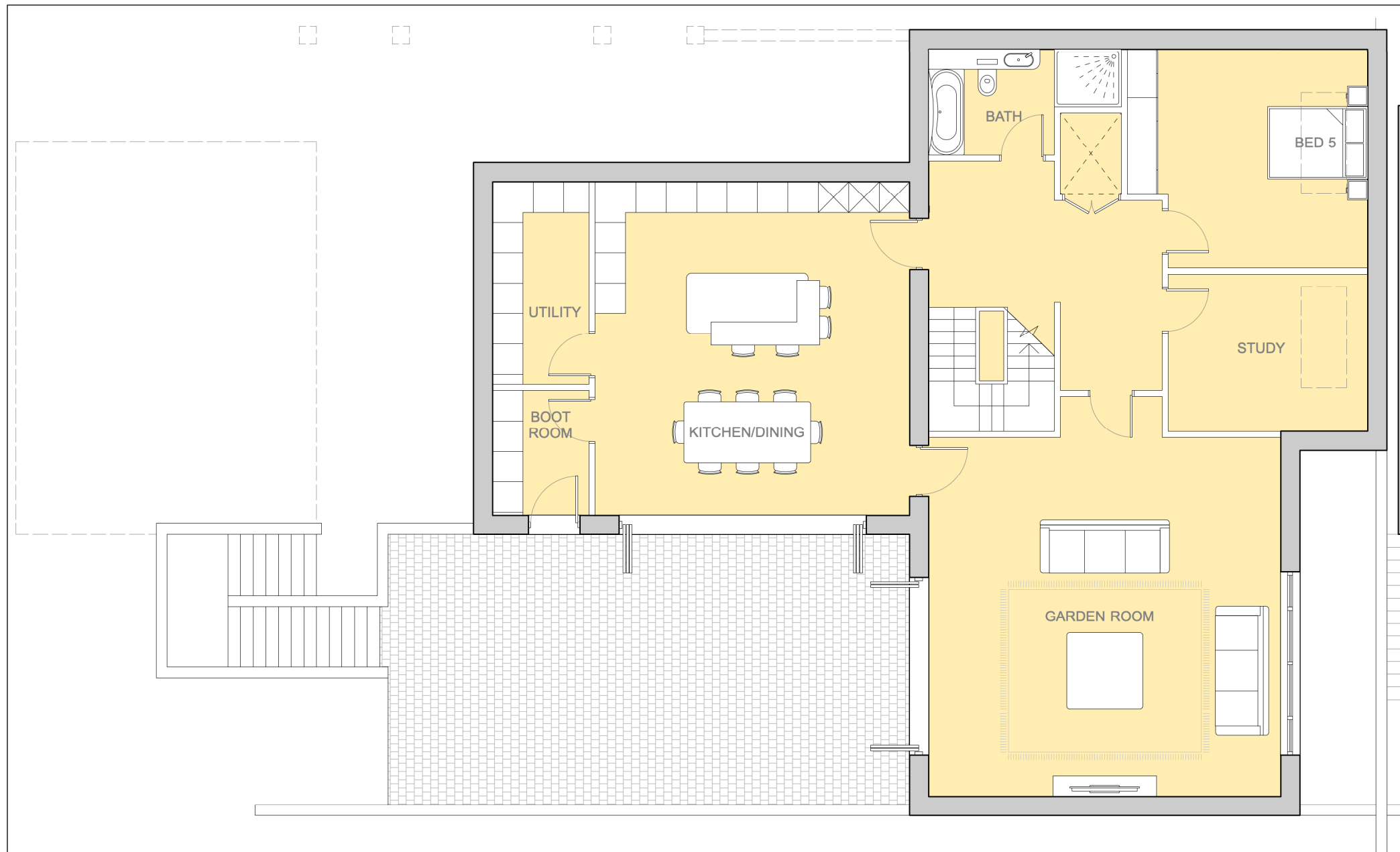
Proposed Lower Ground Floor Plan - 1:100 @ A3