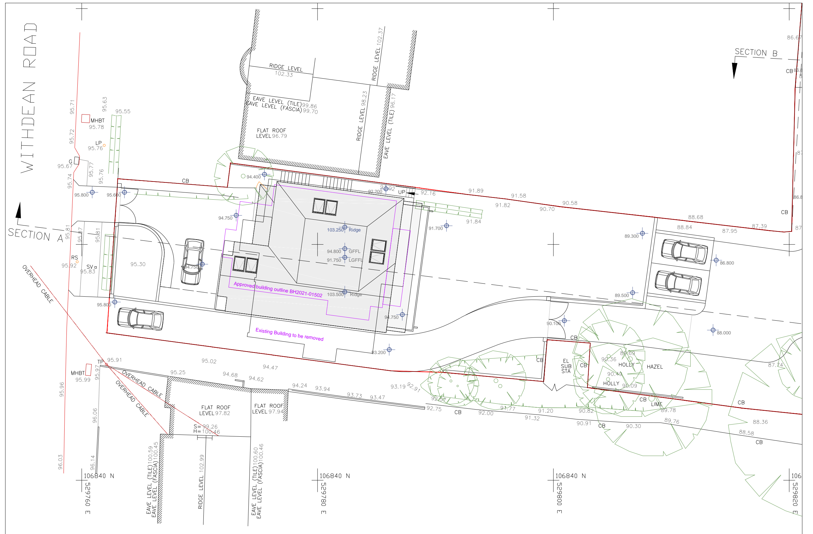
Proposed site layout - west scale 1:200 @A3