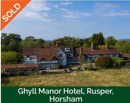
Ghyll Manor Hotel, Rusper, Horsham