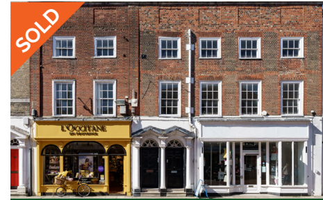
23 & 24 North Street, Chichester