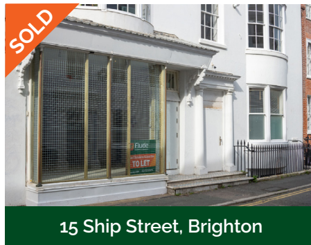
15 Ship Street, Brighton