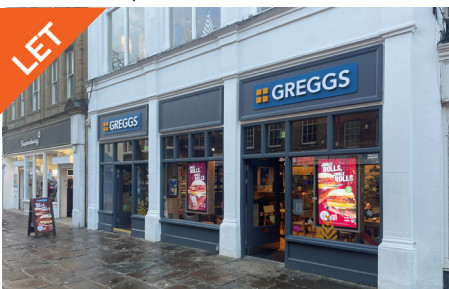
81/82 East Street, Chichester