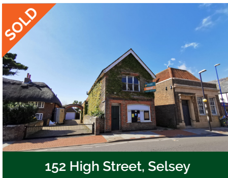
152 High Street, Selsey