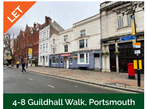
4-8 Guildhall Walk, Portsmouth