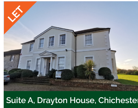
Suite A, Drayton House, Chichester