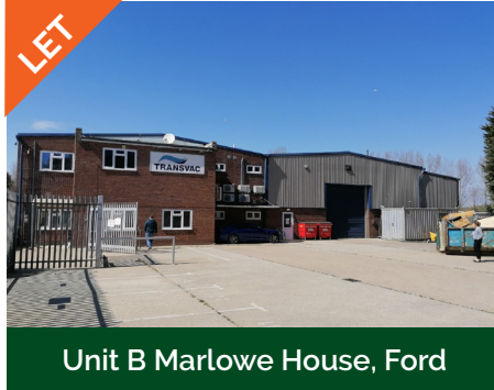
Unit B Marlowe House, Ford