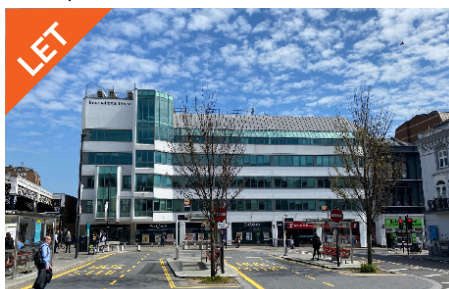
International House, 78-81 Queens Road, Brighton