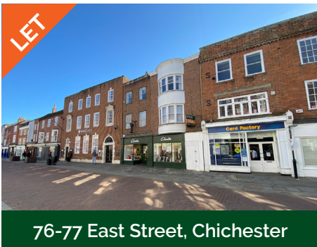
76-77 East Street, Chichester