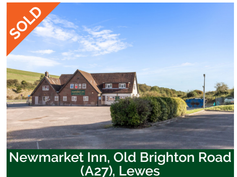
Newmarket Inn, Old Brighton Road (A27), Lewes