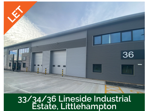
33/34/36 Lineside Industrial Estate, Littlehampton