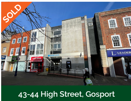
43-44 High Street, Gosport