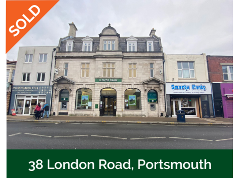
38 London Road, Portsmouth