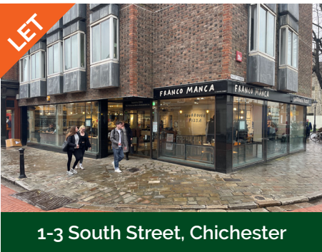
1-3 South Street, Chichester