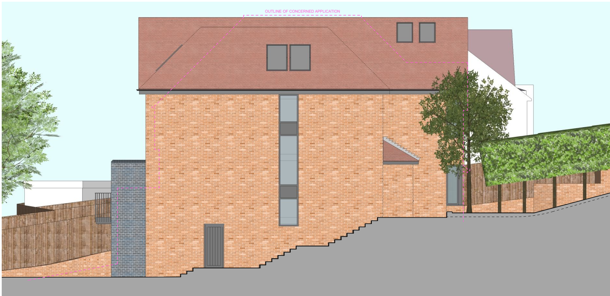
No. 8 - NORTH ELEVATION

This drawing is for the below approval only and is subject to Planning Approval. This drawing has been based on third party survey and scheme drawings. Do not scale from this drawing (LA Planning Dept. can scale the drawings). The Architect, Turner Associates & Richard Silver (RS Design - Architect Ltd.), own the copyright in the drawings and documentation produced in the course of the project. The client named below has a licence to copy and use the drawings and documentation only for purposes related to the project named below at the stage noted above. No drawings or client details will be released to anyone other than the client, unless given written instruction for distribution.