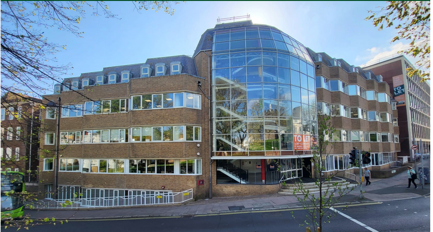
Lees House 21-23 Dyke Road, Brighton BN1 3FE