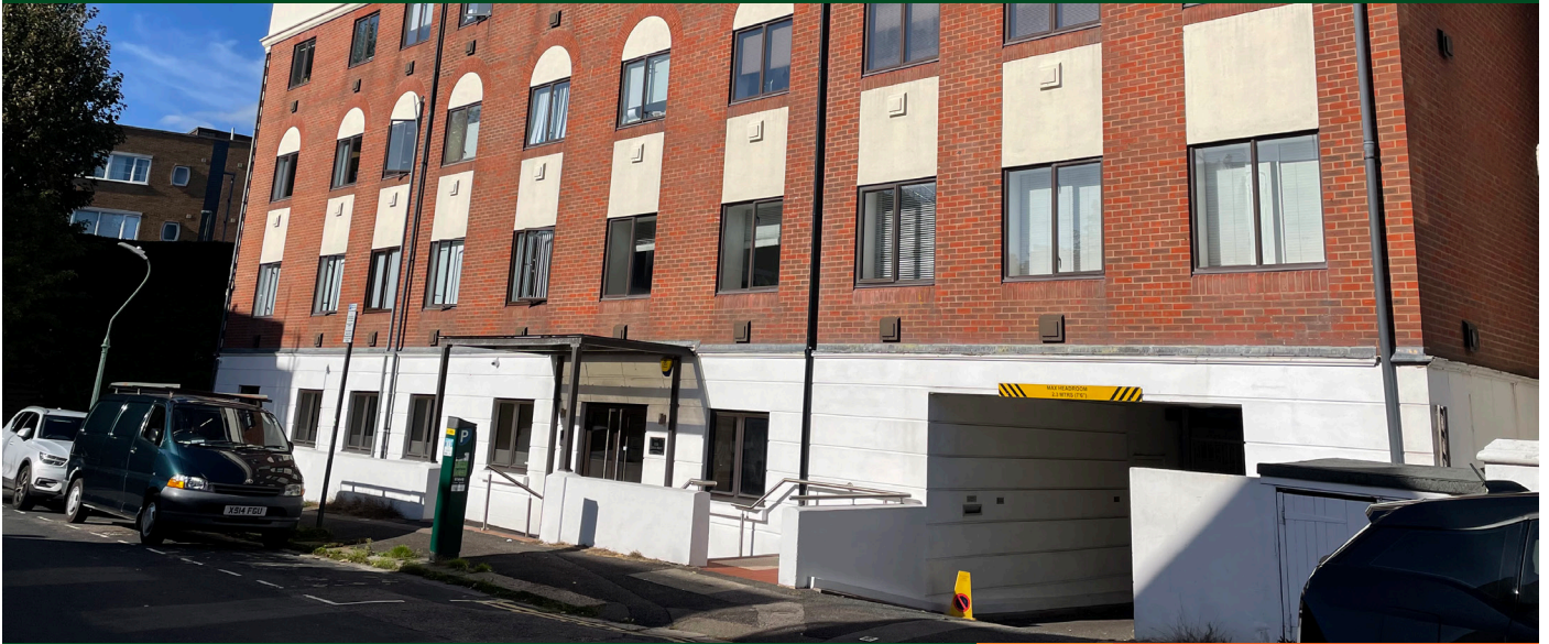
Ground Floor, Lorna House Lorna Road, East Sussex, Hove BN3 3EL