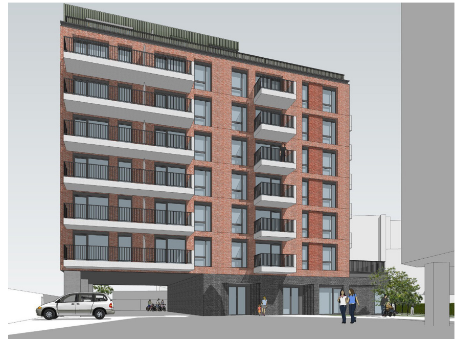
Proposed View - East