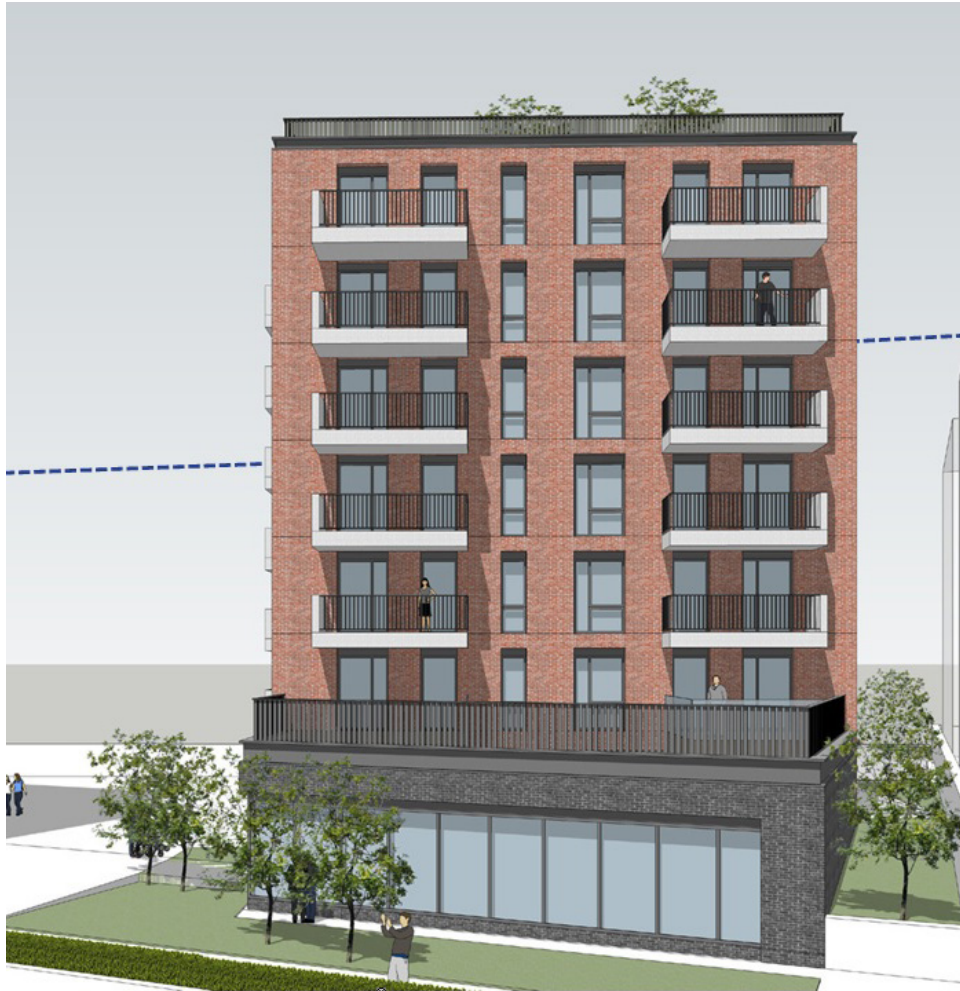
Proposed View - North West - Towards Lyon Close Development